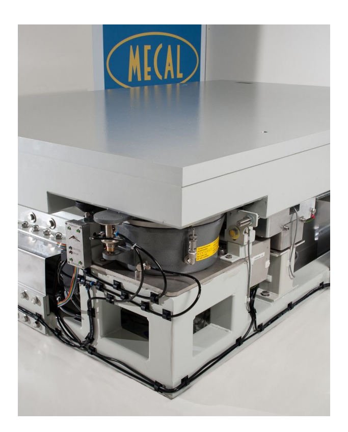
Figure 2: The test-frame.