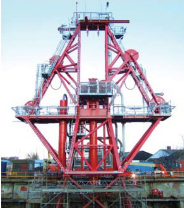
Figure 1: Drill string compensator (20m tall).

The University of Agder in Norway, together with the industry partner Aker Solutions, have developed a Hardware-in-the-Loop (HiL) testing environment for a typical machine, the drill string compensator, shown in Figure 3.