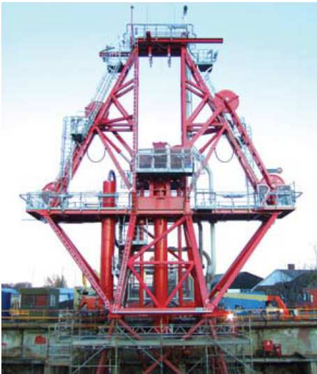
Figure 1: Drill string compensator (20m tall)

University of Agder and Aker Solutions, Norway