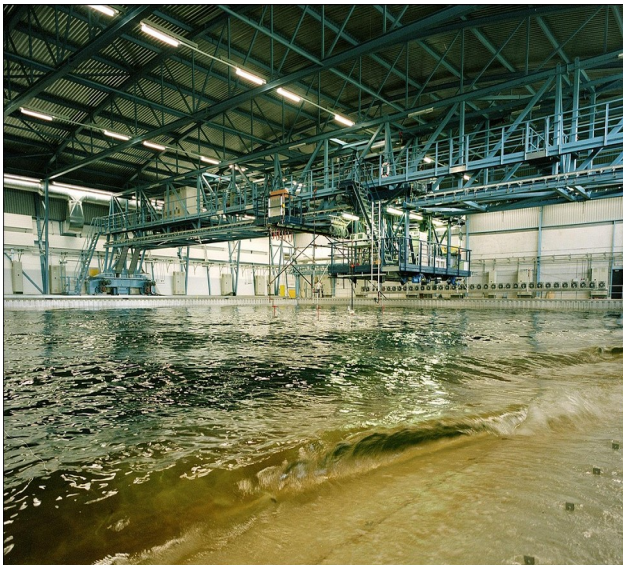
The Sea keeping and Manoeuvring Basin.

The Sea keeping and Manoeuvring Basin has been built with special equipment to generate waves in an arbitrary direction. To keep track of the ship model and support its data cable coming from the ship model, a carriage was designed. The carriage runs over the total length of the basin. It consists of a mainframe, spanning the full width of the basin and a sub frame. The carriage can follow all movements of the model in the horizontal plane. On the sub frame of the carriage a platform is mounted with equipment for storage and analysis of the measurement data coming from the ship model. The platform can carry up to 6 people to operate the carriage and measurement equipment.